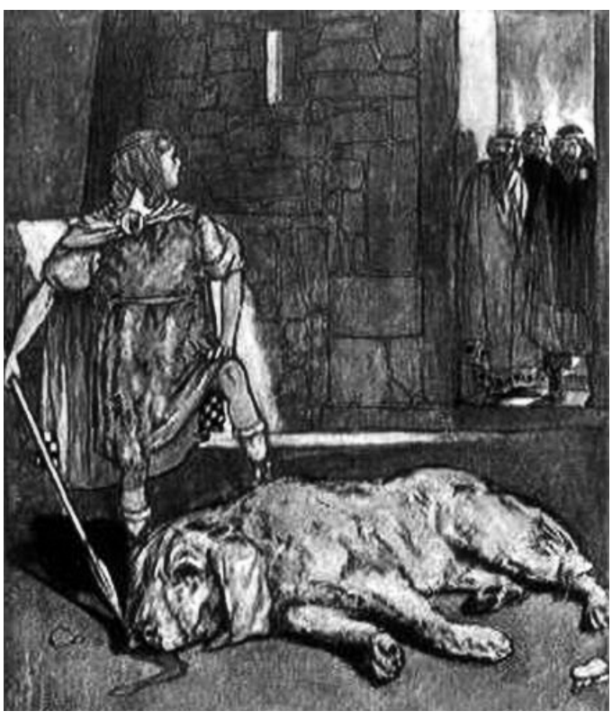
"Cuchulain Slays the Hound of Culain", illustration by Stephen Reid from Eleanor Hull's The Boys' Cuchulain , 1904

Under the moon the mountains lie sleeping Over the lake the stars shine. They wonder if you and I will be keeping The magic and music, or leave them behind.