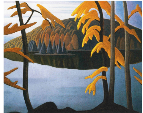
Northern Lake, Lawren S. Harris

Bruce Sled explains these very Canadian-themed pieces: “ paddle is meant to accompany and reflect the physical motion of paddling a canoe....At one point the balance of the canoe is upset by slightly choppy time signatures. Northern Lake was inspired by a painting of the same name by Lawren S. Harris, one of the famed Canadian Group of Seven. The music reflects Harris’ beautiful painting with its smooth, simplified landscapes and dramatic lighting. The text of WOODS is a word chain of types of trees. I was inspired by the repeating, complex, and overlapping patterns of wood grain to create this sometimes-polyrhythmic composition”.