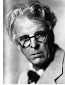
William Butler Yeats 1865-1939

O sweet everlasting Voices, be still; Go to the guards of the heavenly fold And bid them wander obeying your will, Flame under flame, till Time be no more; Have you not heard that our hearts are old, That you call in birds, in wind on the hill, In shaken boughs, in tide on the shore? O sweet everlasting Voices, be still.