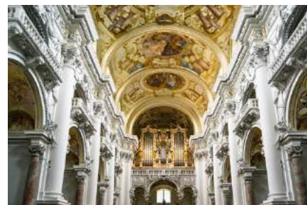
Basilica of St. Florian Monastery

Os Justi is deeply expressive with simple and gentle homophonic chords at the beginning that gradually crescendo to lush and powerful cascading suspensions. The middle section is polyphonic in nature with long expressive lines interweaving to create a beautiful and moving melange. The work ends with the same structure as the opening and finishes with rich sustained chords, gentle yet powerful.