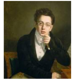
Schubert, by Josef Abel

Schubert's lyrical Mass in C Major was completed in 1816 when the composer was the youthful age of 19. It was first performed, as were most of Schubert's early masses, at his parish church of Lichtental, a suburb of Vienna, where he grew up and sang as a choir boy. Our touring choir will sing there this June. This Mass does not include any extended solos, but requires an excellent quartet of singers who contribute greatly to the Mass as a whole. It is full of energy and joy with a light and airy texture – perfect for springtime. Listen to the choir and soloists weave together like a dance.