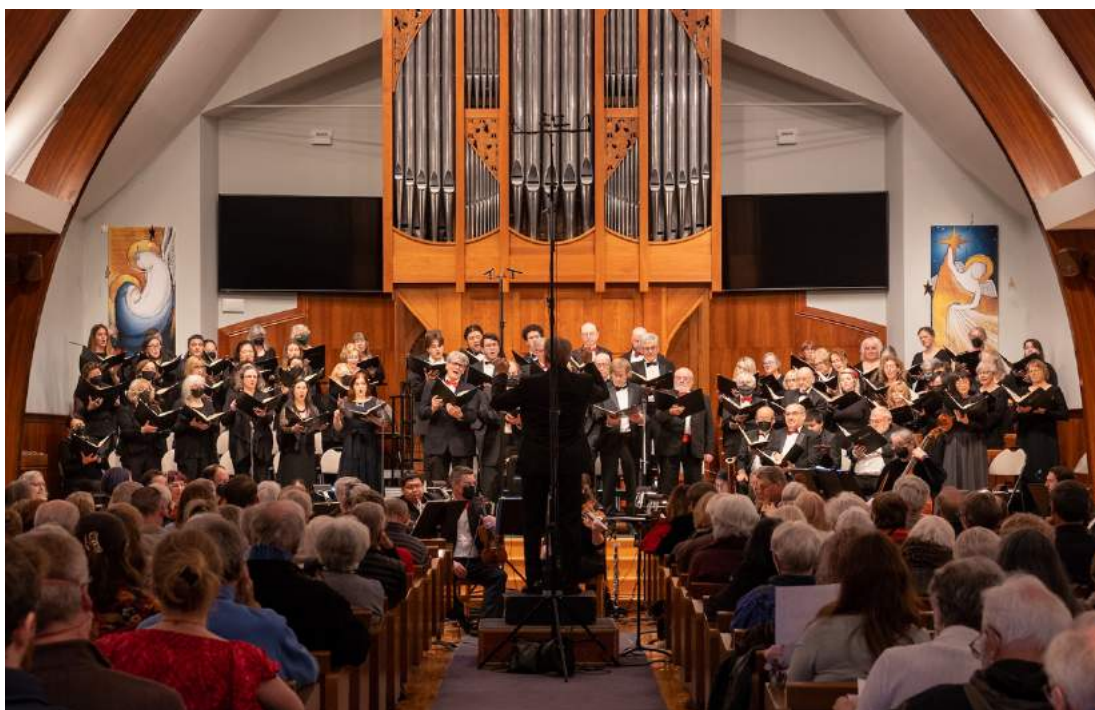
Paragon Singers, Laudate Singers, guest soloists, Baroque Orchestra Bach's Christmas Oratorio, December 2022.

Rehearsing on Monday evenings, this friendly group welcomes new members. An audition can be arranged by contacting the Society at info@laudatesingers.com