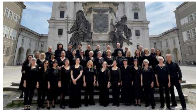
Paragon/Laudate Touring Choir in front of the Salzburg Cathedral, one of our performing venues, June 2023

May 27th is your opportunity to hear the tour repertoire at an informal concert and to bid the choir farewell.